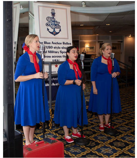
Patriotic Music by The Blue Anchor Belles