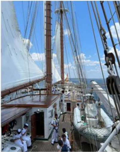
JS Elcano departing Pensacola Bay.

The big event of the year by far was the Council serving as Pensacola's official host of the Spanish Navy Training Ship Juan Sebastian de Elcano on it's port visit from May 29 until Friday, June 2. The port visit was a significant success. Attendance for tours was fantastic. The Navy League reception at Seville Quarter was very well attended, A proclamation from the County was presented and gifts were exchanged. The port visit provided great exposure for the Navy League. The ship even delayed departure one day to allow for participation in the Fiesta of Five Flags events. Everyone had a great time. We expect to see The Elcano return to Pensacola soon.