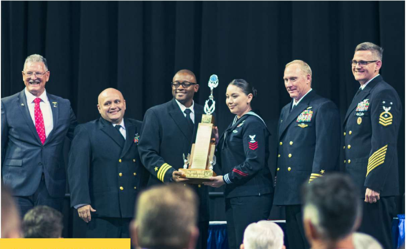
Photo from Military Recognition Day

NEWS FROM THE NAVY LEAGUE OF THE UNITED STATES PENSACOLA COUNCIL