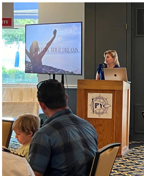
Photos from Spouse Appreciation Luncheon