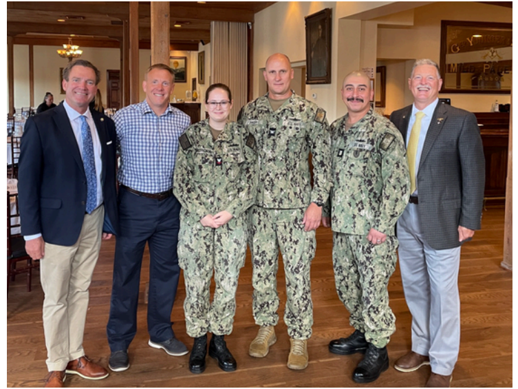
Photos from Enlisted Recognition Breakfast