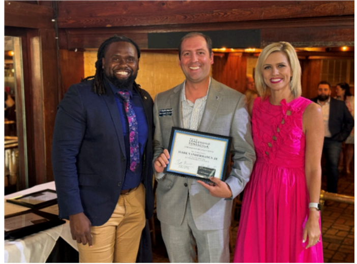
Photos from LEAP graduation