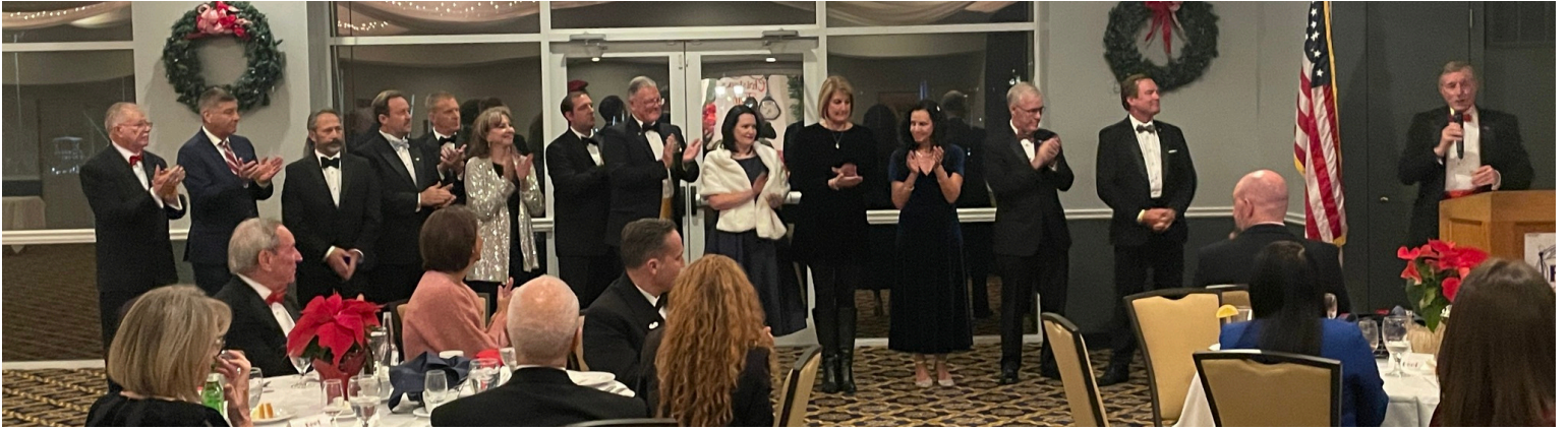
Photo from 2024 Christmas Party from PNL Facebook Page