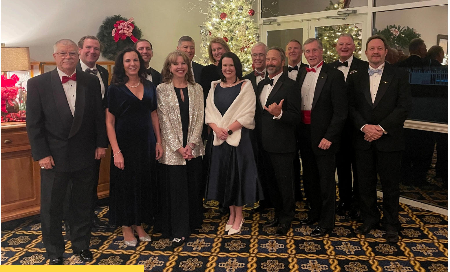
Photo from 2024 Christmas Party

NEWS FROM THE NAVY LEAGUE OF THE UNITED STATES PENSACOLA COUNCIL