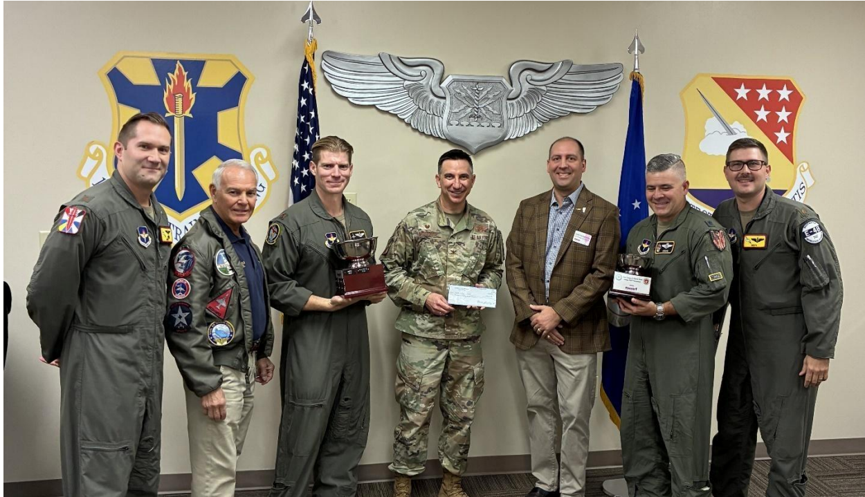
Presentation of the traveling trophy and bowl to USAF 479 th FTG